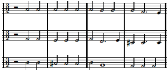
Figure 20.2 Buxtehude, Membra Jesu Nostri , No. 3 Ad manus , mm. 131-133.