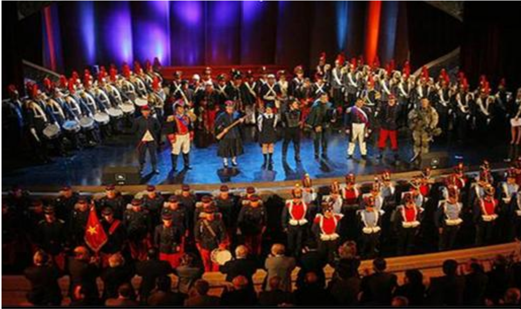
Figure 6. “The Chilean Army” Contest. Closing Ceremony 2008.

Taken during the closing award ceremony, this picture shows a female high school student surrounded by historic military figures and contemporary soldiers. The background of the proscenium theatre is painted with the colors of the national flag, and is flanked on both sides by cadets in parade uniforms. Apart from the student, there are no civilians on stage. Two formations of soldiers representing troops from Independence times and the Pacific War expand the stage by invading the audience space. The audience, the civilian world, is a mere spectator of the scene and stands applauding the staging. The image reifies the traditional military narrative of Chilean history where male soldiers occupy center stage, and where the civil world, women, and indigenous people are utterly underrepresented, invisibilized or relegated to the condition of mere spectators.