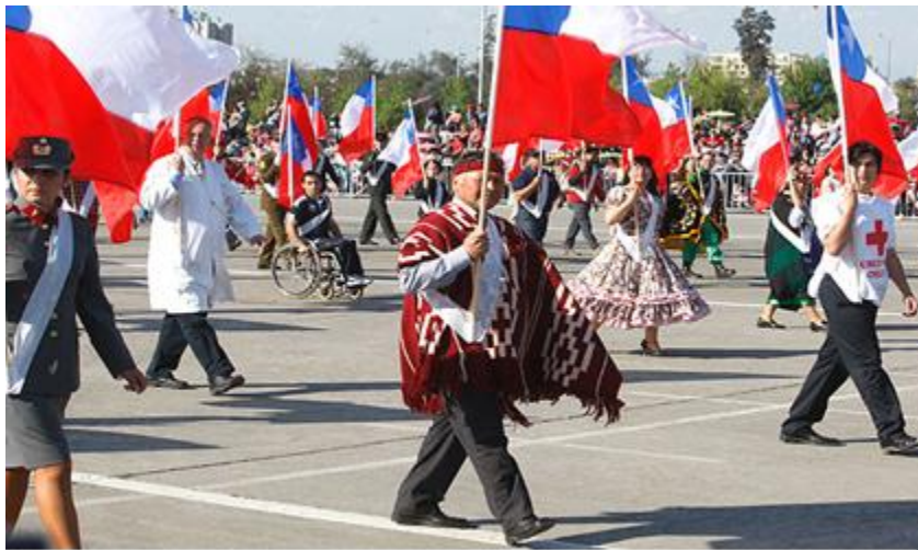
Figure 7. Mapuche in the MP 2010.