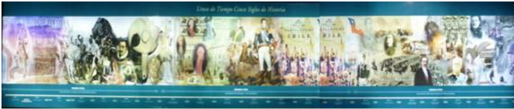
Figure 5. "Five Centuries of History". Chilean Historic and Military Museum

collection of printings, paintings and photographs that illustrate key moments of Chilean History.