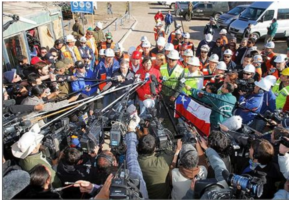
Figure 1. Press Conference in Camp Hope

during the day, and it was common to see a swarm of journalists around government officials in charge of keeping them informed.