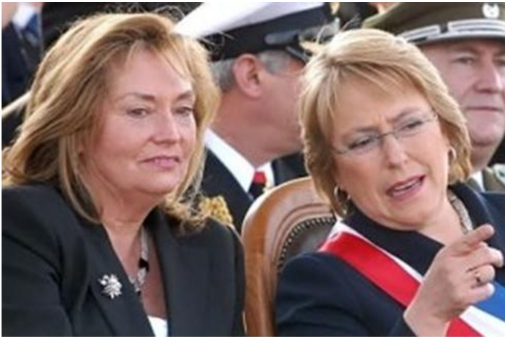
Figure 4. President Michelle Bachelet (right) and her Minister of Defense Vivianne Blanlot, presiding the Military Parada. 2006.

In a perverse historical counterpoint, in the MP 1974 Augusto Pinochet celebrated the purification of the nation from the “inherently perverse” Marxist ideology. Presiding at the MP performance were the four commanders in chief of the four branches of the Armed Forces and Order (Army, Navy, Air Force, and Police). Their uniformed presence occupied the same spot that President Allende, now dead, occupied in 1972. In this context the MP was a clear statement that the repressive state apparatus was obedient to the new political authorities and ready to act in their support against the internal enemy.