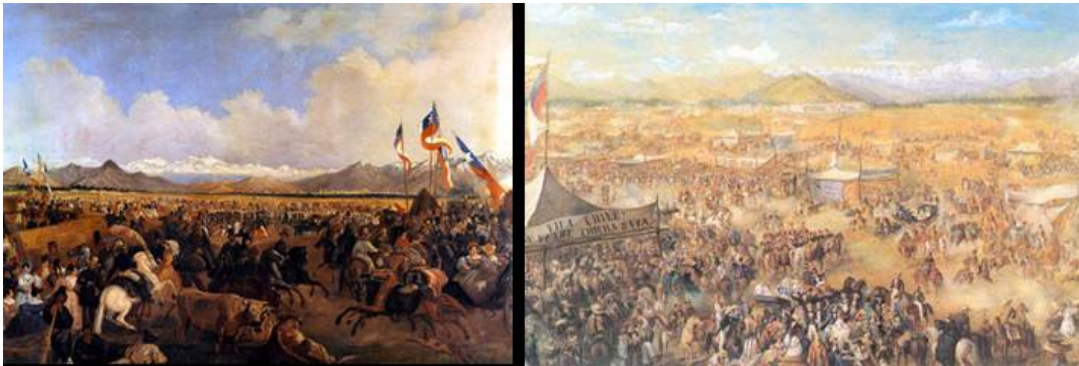
Figure 8. Presidente Prieto llegando a la Pampilla

The excessive embellishment of the military prose makes me suspect a sort of functionality that it could be accomplishing. There are several hypotheses that come to mind when trying to make sense of the predilection that the militaries have in using this rhetorical style. I think for example, that in doing so they align themselves with military heroes from the past who have been characterized by some historians and chroniclers as having portentous rhetorical skill to create beautiful and encouraging phrases in both the battle and political fields. Thus, since flamboyant prose would have become a distinct characteristic of the hero, adopting such a style creates a kind of identification between the officer that utters it today and some prominent member of the military pantheon.