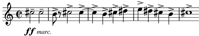
FIGURE 18. Miklós Rózsa, Theme, Variations and Finale , Variation 8, rehearsal 37.

The brass usher in a new theme at rehearsal 37 that will continue to be developed along with the fiddle tune. The cellos take the lead in a piu mosso at rehearsal 40 that has no direct tempo relationship to the previous section. This transition requires several attempts to establish a clear tempo memory for the cello section. The fiddle tune and subsequent themes continue their development until a molto rallentando ushers in the return of the original oboe theme in the strings at rehearsal 43. The brass take up the tune for its second half. The fiddle tune returns in a final vivacissimo and works into a unison G-pentatonic scalar passage in the strings before the brass punctuate chords over a molto allargando to bring the work to an exciting finish. The last measure suddenly snaps back to tempo and Wescott comments, “by a single gesture [the last measure] dismiss[es] the whole [work] as a mere flight of fancy.” 60