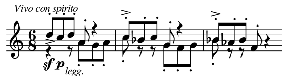
FIGURE 10. Miklós Rózsa, Theme, Variations and Finale , Variation 5, mm. 1-3.

“Variation 5. Vivo con spirito , 6/8. The brass has a lively version of the subject, in conversation with woodwind and celesta.” 51