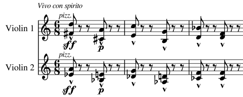
FIGURE 11. Miklós Rózsa, Theme, Variations and Finale , Variation 5, mm. 1-3. Violin chords.

These two textures are rocketed forth by a crash cymbal on the first beat of the variation. It is marked to be choked on the second beat, and should not be so loud that the chords and trumpets beneath it are lost to the ear. In the fifth measure, the cymbal returns at a pianissimo marked “ pendenti. ” Rózsa’s recording, as well as Sedares’s recording with New Zealand, both play this note with a soft mallet on a suspended cymbal. However, the Bernstein and Gamba recordings have a very quiet crash. The sound of the suspended cymbal is more suited for the new texture of woodwinds and celesta that occur below it. 53