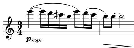
FIGURE 13. Miklós Rózsa, Theme, Variations and Finale , Variation 6, mm. 32-33.

The flute’s first tune starts in C major, with a perfect fifth drone below it in the cellos and harp. Though it is an expressive and pastoral melody based on the second half of the original oboe theme, it is modified to contain leaps of fifths and seconds inverting the dotted rhythms derived from the theme. Rózsa brings this movement to a climax at rehearsal 24 by way of another poco stringendo before a molto ritardando in the penultimate measure. This is the first variation to climax with a major chord: an E-major chord signals the return of the tune. A secondary theme dominates both sides of the climax and is written most expressively in the high clarinet six measures before rehearsal 26.