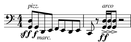
FIGURE 6. Miklós Rózsa, Theme, Variations and Finale , Variation 3, mm. 1-2.

“Variation 3. Poco meno allegro, ma sempre molto energico . The theme, changed in rhythm, is accompanied by alternate pizzicato and bowed figuration. It develops to a climax with the theme high in the strings and imitations of it in the brass.” 47 The pizzicato version of the theme played by the low strings at the top of this variation forgoes the usual dotted rhythm in favor of a series of eighth notes. No other instruments play during this low-string pizzicato, so there is no danger of balance issues. Therefore, careful consideration can be paid to the printed dynamics in the opening low string pizzicatos: their second pizzicato passage is marked mezzo forte , which is different than the passages before and after it. This difference is not noticeable in any commercial recording, and it helps the theme relate back to the oboe dynamics at the top of the piece.