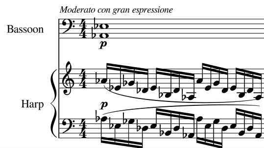
FIGURE 9. Miklós Rózsa, Theme, Variations and Finale , Variation 4, mm. 1.

This variation, in the Neapolitan key of A-flat dorian, begins with a series of descending fourths in the harp while the bassoons play a perfect fifth as a drone behind it.