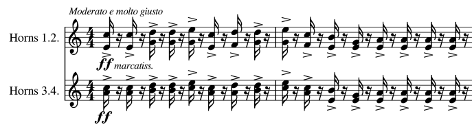
FIGURE 16. Miklós Rózsa, Theme, Variations and Finale , Variation 8, mm. 5-6.

“Variation 8. Moderato e molto giusto , 4/4. Heavy accents and general robustness are reminiscent of a peasant dance. A crescendo of timpani and a roll of the bass drum are added to the final orchestral uproar.” 58 The second half of the theme is used in short marcato sixteenth-note strikes.