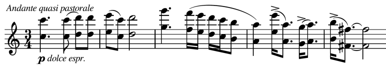
FIGURE 12. Miklós Rózsa, Theme, Variations and Finale , Variation 6, mm. 1-5.

finish, solo strings play the pastoral subject in harmonies, which mixed with harp and celesta, creates an atmosphere of mystery and unreality.” 54