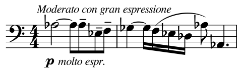
FIGURE 8. Miklós Rózsa, Theme, Variations and Finale , Variation 4, mm. 2-3.

This variation, in the Neapolitan key of A-flat dorian, begins with a series of descending fourths in the harp while the bassoons play a perfect fifth as a drone behind it.