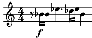
FIGURE 5. Miklós Rózsa, Theme, Variations and Finale , Variation 2, mm. 3.

The strings, trumpets, and horns take turns playing a short interjecting fanfare composed of a perfect fourth followed by a major second, which is the same intervallic relationship of the first three pitches of the theme. This fanfare also runs the risk of dragging because of its dotted rhythms and off-beat entrances.