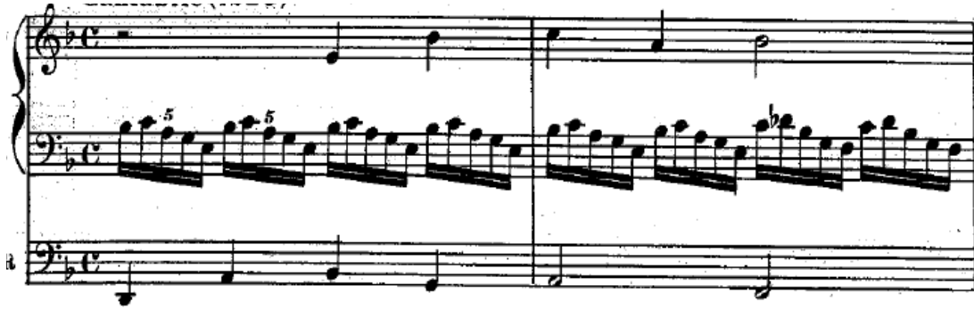
(Example 5, Var. 8 mm. 1-2)