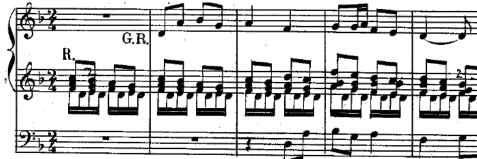
(Example 3, Var. 3 mm. 1-5)

The compass for this variation is only a little more than two octaves, using only 8' stops for both manuals and pedal. This causes considerable dissonance between the theme and the accompaniment, often a clash of A and Bb, as shown in example 3.