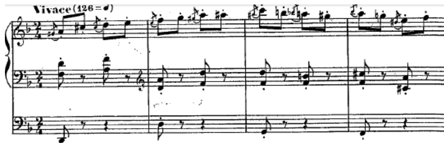
(Example 4, Var. 7 mm. 1-4)

The seventh variation is especially lively and joyous. The indicated registration of 16' and 4' flutes accentuates the charming spirit of this variation, giving it both depth and a sparkling disposition. Dupré's vivace tempo marking indicates that the treble line should move quickly. Acciaccaturas decorate every beat and the accompaniment outlines the harmonies, shown in example 4.