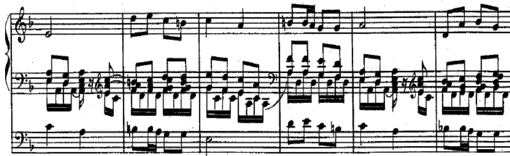
(Example 2, Var. 3 mm. 13-18)

The third variation is in the form of a canon at the octave. It is the slowest tempo marking of all of the variations. The theme is first heard in the treble, followed in the pedal on organ foundation sounds. Once again Dupré changes the theme slightly to end both phrases of the A section on the tonic chord. There is also a poignant moment in m. 18 (Example 2, last measure), when he alters the pedal note by lowering the B natural by a half step. It is an unexpected harmonic change that perhaps foreshadows the eighth variation, in which a canon at the second creates a tritone from E to Bb. (See Example 5)