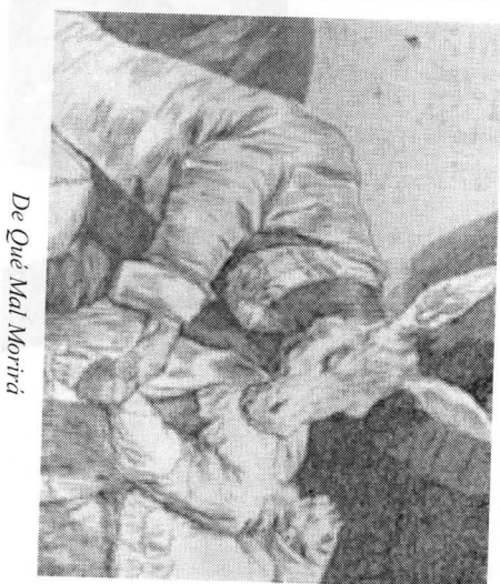
De Qué Mal Morirá