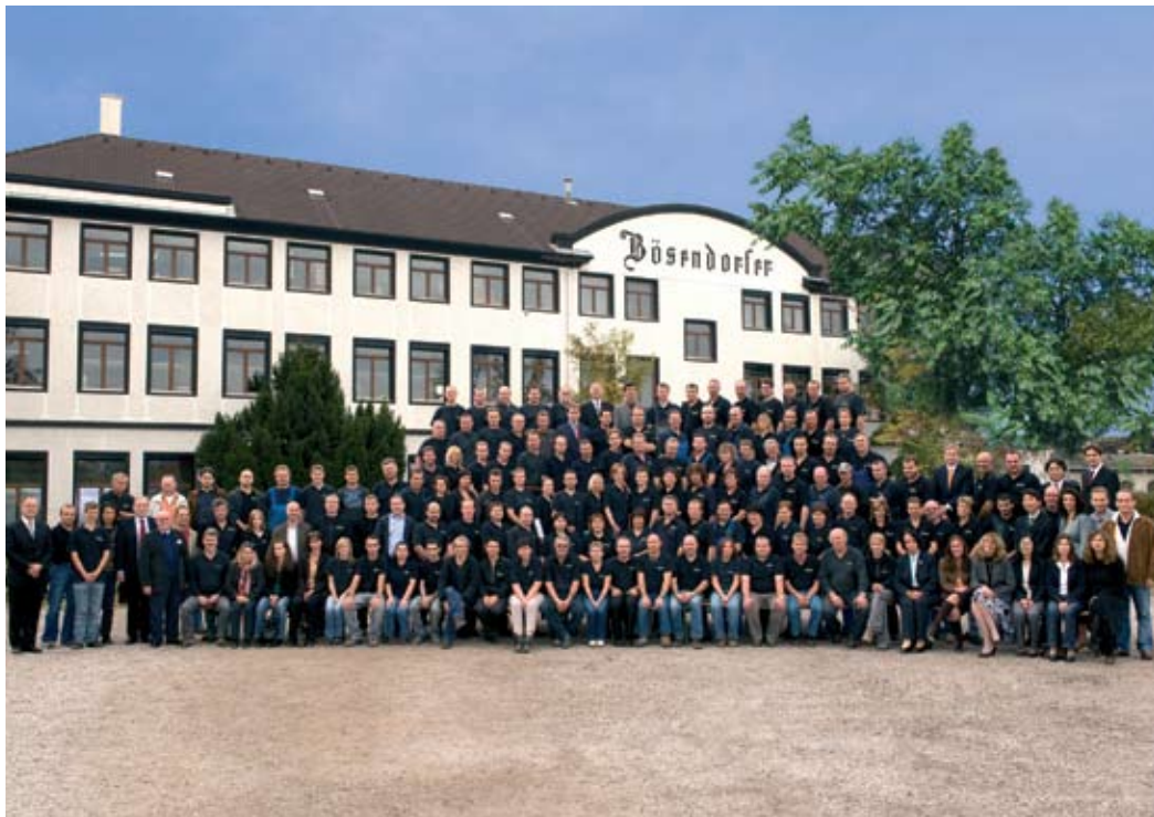
Your Bösendorfer Team from Vienna, Austria

We wish you Good Luck and a lot of Success