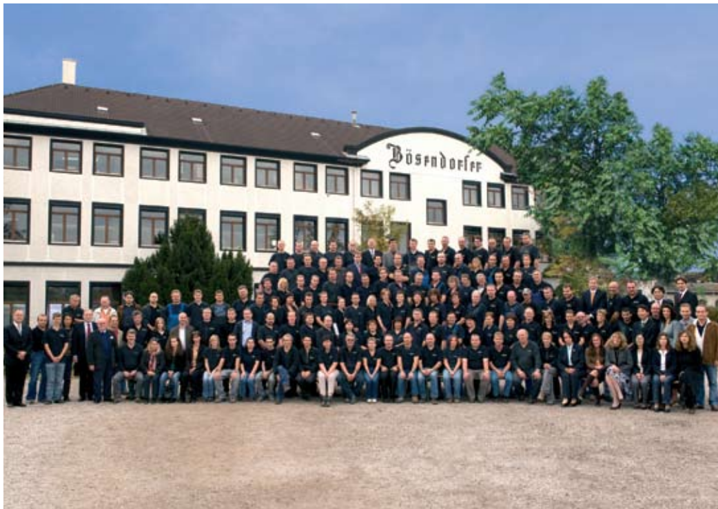
Your Bösendorfer Team from Vienna, Austria

We wish you Good Luck and a lot of Success