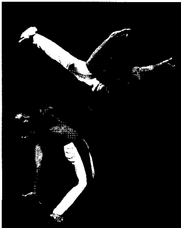
Capoeiras of Bahai