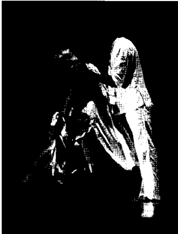
Companhia Paulista de Dança