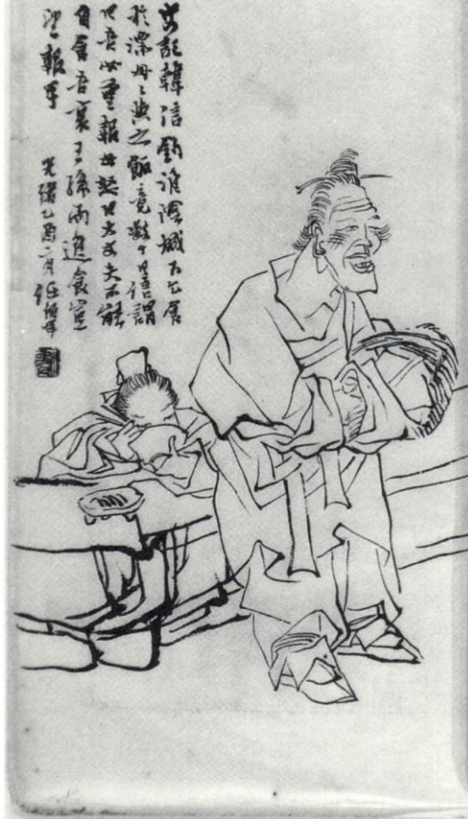
Figure 8. Ren Yi, HanXin Being Fed by the Washerwoman , from Dianshi Zhai Huabao 43 (1885).