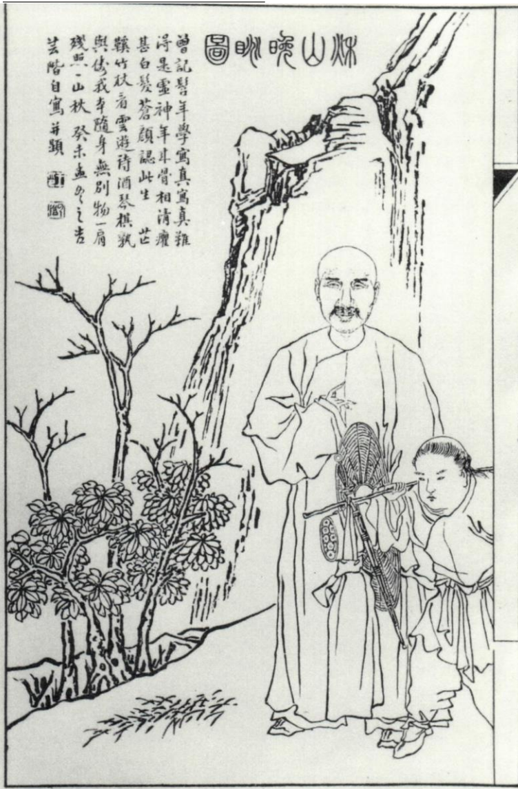
Figure 3. WangYijie, Self Portrait , from YixiuTang Huazhuan (1883), juan 3.