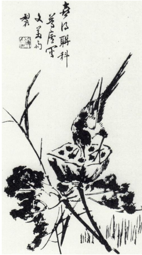
Figure 10. Zhu Cheng, Bird and Lotus Pod , from Zhu Menglu Huaniao Jian , Changchun Shi Guji Shudian 1983 reprint of original edition, about 1892.