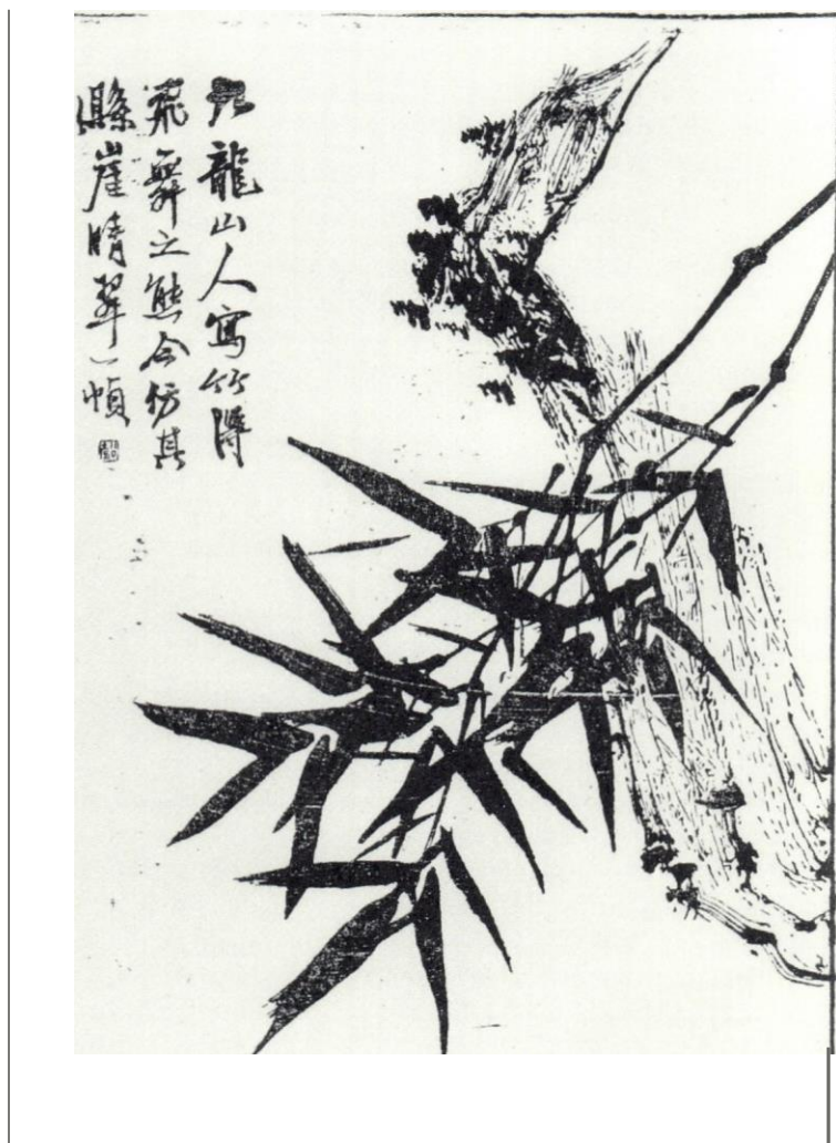
Figure 7. Hu Yuan, Bamboo and Rock , from Haishang Mingjia Huagao (about 1886).