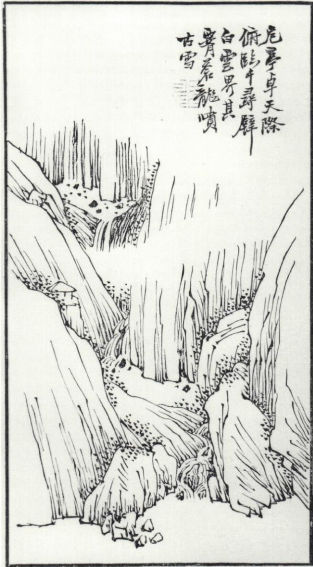
Figure 4. Chen Yunsheng, Winter Landscape , from Renzhai Huasheng (1878), 2 /r5.