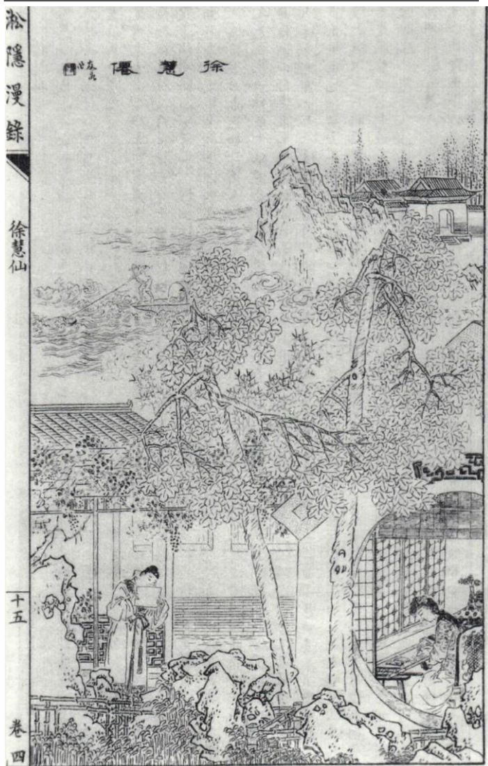
Figure 1. Wu Youru, illustration to Wang Tao's story, 'Xu H uixian' from the series Songying Manlu . From Dianshi Zhai Huabao 43 (1885).