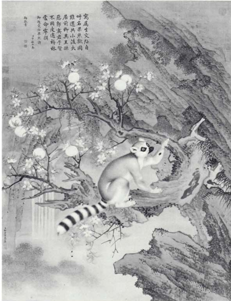
Figure 4. Giuseppe Castiglione, The Monkey of Vietnam . Collection of the National Palace Museum, Taiwan, Republic of China.

These horses to be drawn; The color was applied fine and dense And minutest details were put in, And they looked just like the four steeds Ascending sandy banks. But while resembling they only resembled And so yield to ancient models. 36