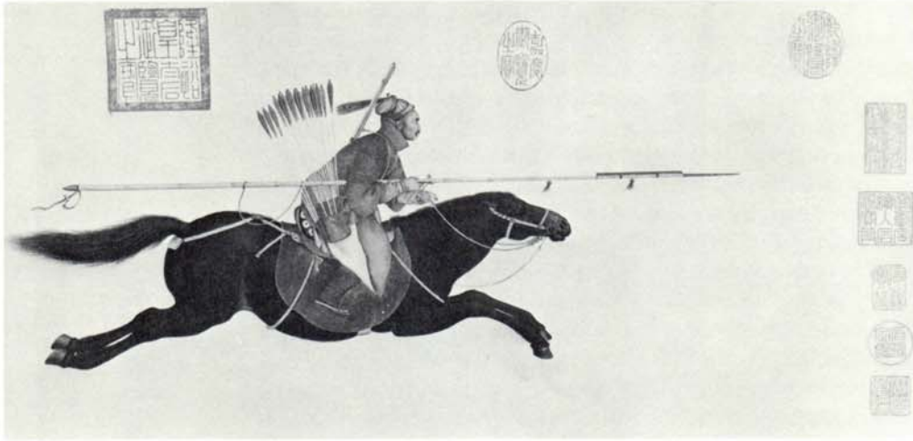
Figure 3. Giuseppe Castiglione, Ayuxi Assailing the Rebels with a Lance . Collection of the National Palace Museum. Taiwan, Republic of China.

ordered Lang Shining to depict the valorous guardsman and himself composed a poem for the scroll so that 'a thousand autumns hence this man will be known.' 28 Another of the Mongol leaders had in the meantime declared his allegiance to the emperor but then rebelled again. The large armies sent to defeat the rebel were successful but the leader himself escaped to safety with the Eastern Kazaks, who at first refused to surrender the fugitive. In 1757, however, the leader of the Eastern Kazaks concluded that discretion was indeed the greater part of valor and sent these tribute horses and other gifts to the emperor as tokens of his allegiance. The stability of that newly-pledged loyalty was thus still in question when Lang painted this portrait, which captures perfectly the emperor's justifiable mood of skepticism. Horses from the Western regions had reached the Chinese court as early as the Han dynasty, during the reign of Wudi, and the Qianlong emperor's achievement in subjugating that same region allied him with the great emperors of the past. Lang's painting thus records a specific event but one which had historical associations, and his work catered to the emperor's liking for well-painted portraits of horses while yet satisfying his imperial need for image enhancement.