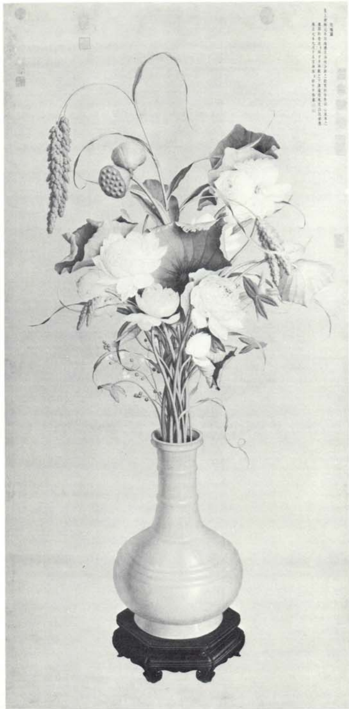
Figure 1. Giuseppe Castiglione, Jurui Tu ('Collection of Auspicious Tokens'). Collection of the National Palace Museum. Taiwan, Republic of China.