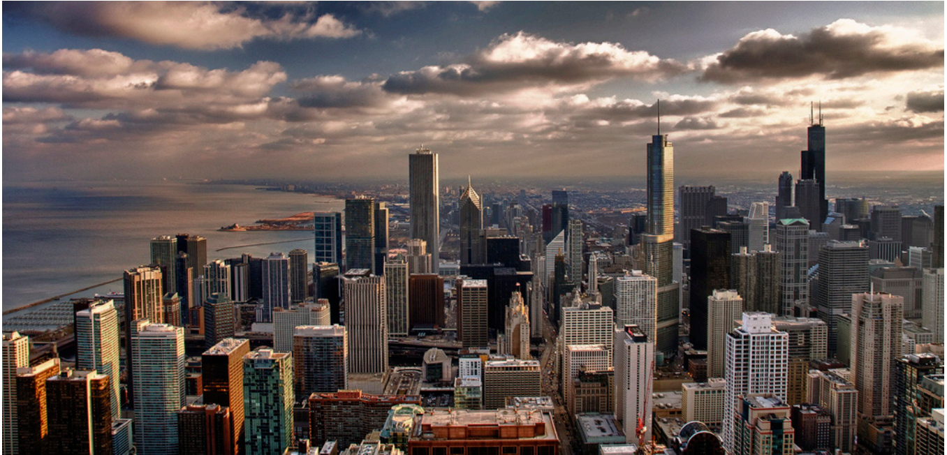
Chicago Sunset from Hancock Observatory