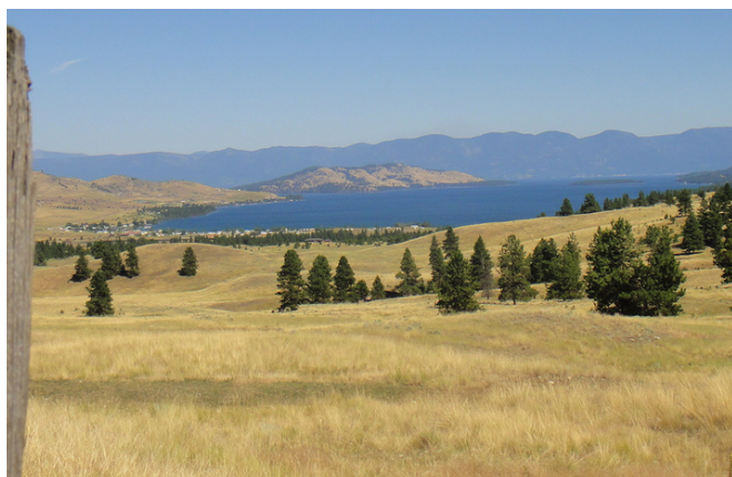
Montana