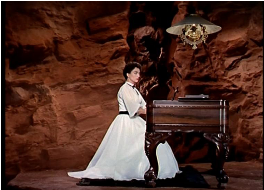
Fig. 9. Joan Crawford as Vienna in Johnny Guitar , 1954

in the proper attire (hiking boots, etc.) but who will never wear them, and ends up lost in the red rocks by night. In this respect, Tanning's novel could be re-read as Chasm: A Western .