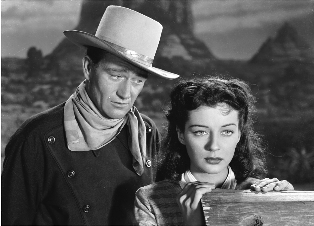
Fig. 3. Still from Angel and the Badman , 1947.