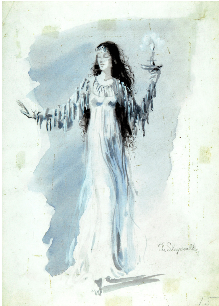
Fig. 5. Dorothea Tanning, Costume Design Night Shadow Sleepwalker, 1945

Westerns in the traditional sense, it seems significant that Tanning is costumed in glowing white garments in both. In the former, Ernst pulls her from underneath a bed as a sleeping beauty or Snow White. In 8x8 , she appears as “The Queen” skipping through the empty streets of Manhattan and then along the rocky ridges of the Colorado River after Ernst enters a porthole into this otherworldly domain, mimicking the narrative trope of Alice’s Adventures in Wonderland . Here a group of cowboys sits by the water’s edge, amused by Tanning’s actions and impractical attire. Comparisons between Tanning and contemporary actor Gail Russell’s coiffure, outfits and faraway, dewy-eyed stares are striking here. In 8x8 , Tanning and Ernst take turns cradling a prehistoric stone, returning it to the base of an equestrian statue