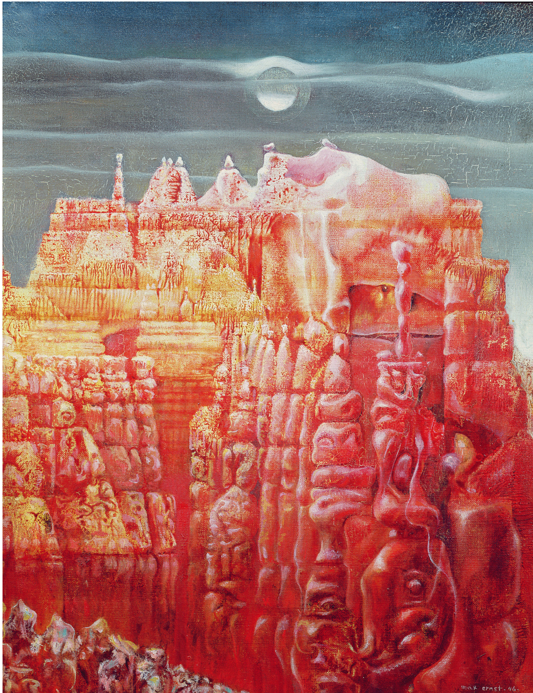
Fig. 1. Max Ernst, Bryce Canyon Translation , 1946. Museu de Arte Contemporaneo, Sao Paulo, Brazil