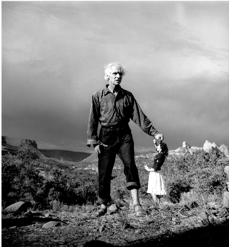
Fig. 7. Lee Miller, Max Ernst and Dorothea Tanning, Oak Creek Canyon, Sedona, Arizona, USA, 1946