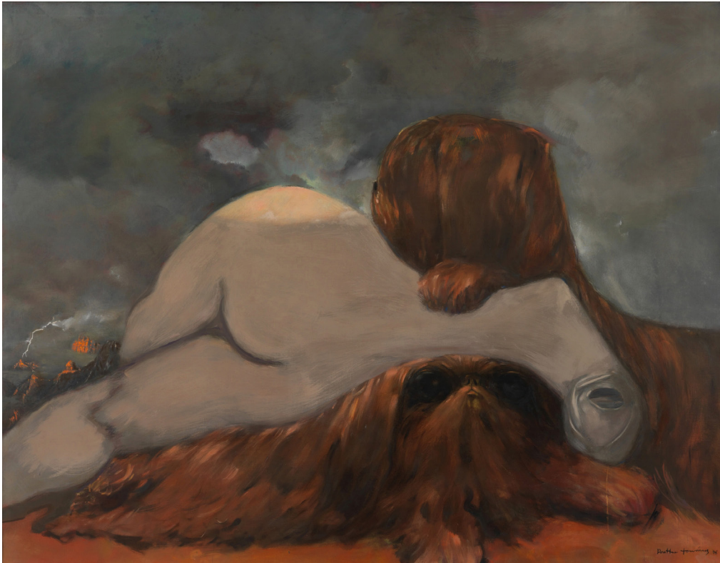
Fig. 4. Dorothea Tanning, Evening in Sedona, 1976. The Destina Foundation, New York