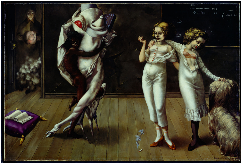
Fig. 6. Dorothea Tanning, Interior with Sudden Joy , 1951. Collection Selma Ertegun, New York

Little girls in white dresses populate Tanning's diminutive, dollhouse-like canvases such as Eine Kleine Nachtmusik (1943) and Interior with Sudden Joy (1951)—both painted in Sedona—where the sublime effects of the vast surrounding landscape have driven her inside her domestic imagination (Fig. 6). 38 Indeed, both serve as examples of introversion, a miniature, interior perspective contained deliberately, in contrast to the unruly vastness of geological time and the Hollywood spectacular outside. Suggestions of “a little night music” and “sudden joy” both evoke the climatic, or even the explosive, and what Soo Y. Kang has referred to as a form of Lacanian jouissance in terms of Tanning's effort at cracking or “jamming” the system. 39 Both feature femmes-enfants (child-women) embroiled in a kind of naughty