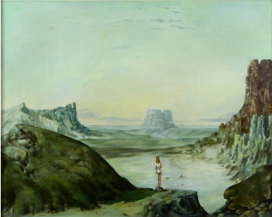
Fig. 1. Dorothea Tanning, Self-Portrait, 1944. San Francisco Museum of Modern Art

abruptly gave way to a band of bright-red rock beneath a peak cap of sun-created pure magenta.” 4 In May 1943, Tanning visited this extraordinary place for the first time, and following a severe bout of encephalitis in 1945, she and Ernst resolved to return more permanently to its warmer climate—Arizona was a desert state well suited to convalescence. Many of the artworks and one novella that she would produce there have come to define her oeuvre (Fig. 1). One fact that has gone largely unreported in the scholarship on Dorothea Tanning to date is that Hollywood was also on location, a stone’s throw from her desert homestead with Ernst.