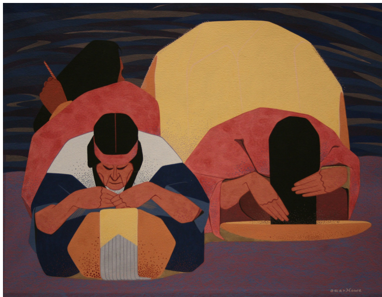
Fig. 7. Oscar Howe, Three Women , c. 1953, tempera on paper. Fred Jones Jr. Museum of Art, The University of Oklahoma, Norman; MFA Thesis selection, School of Art, 1953. Courtesy of the Oscar Howe Estate.

In other paintings such as Woman Buffalo Dreamer (n.d.; Fig. 9), Howe demonstrated an awareness of the elongated forms, desolate plains, and timeless environments of Dali, Yves Tanguy, and Alberto Giacometti. The subject evokes the visionary and oneiric subject matter of the Surrealists, but within a Native context. A buffalo dreamer was usually a male of exceptional visionary ability who helped the tribe locate bison, ensuring the survival of the people. A woman with such abilities