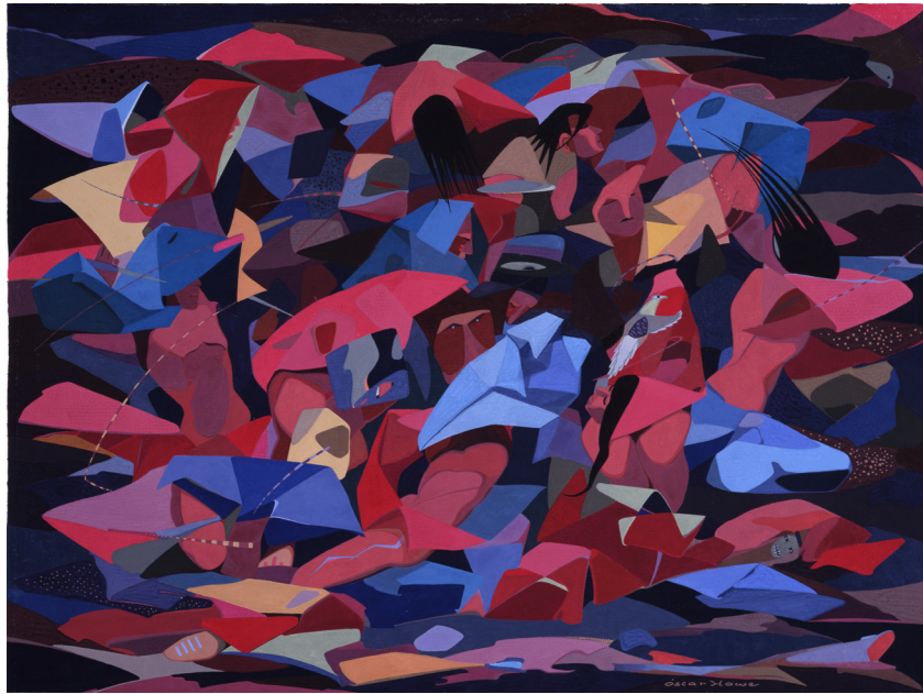
Fig. 8. Oscar Howe, Dance of the Heyoka , c. 1954, watercolor on paper. Philbrook Museum of Art, Tulsa, Oklahoma; museum purchase, 1954.