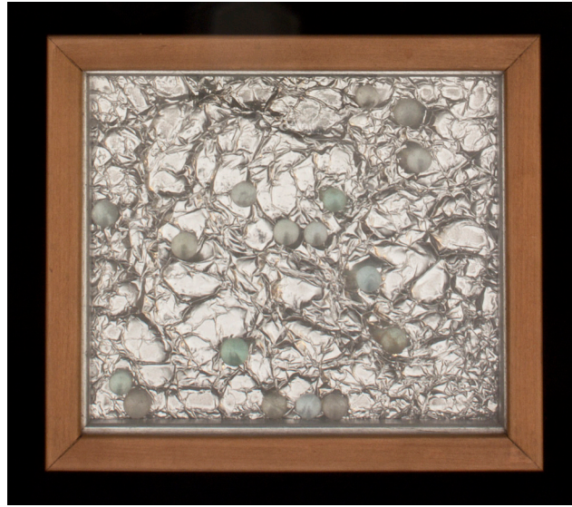
Fig. 2. Kay Sage, Palais de Glace , 1961, mixed media construction, 6 x 6 \frac{3}{4} inches, Collection of the Mattatuck Museum Arts & History Center, Waterbury, Connecticut, Gift of the Estate of Kay Sage, 1964-65

times. Like the identity that Sage realizes will forever be out of control, this game has been snapped free of order and rationale. All of this chaos, however, takes place in the safe confines of a sturdy wooden frame. In the same way that Sage is presenting an irrational identity within the rational and controlled production of a book that she oversees, so too is this rule-free game controlled by the confines she places on it. The title, Palais de Glace , further emphasizes Sage's message that the transitory nature of identity makes it a fragile entity. Like a glass palace that can easily be shattered, identity, and ultimately life, can be easily shattered by a variety of external and internal forces.