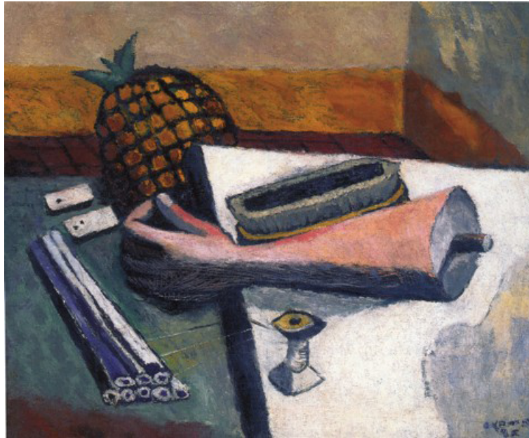
Fig. 6. Rufino Tamayo, Arreglo de objetos (Arrangement of Objects), 1928, oil on canvas, Los Angeles County Museum of Art, Museum Associates, the Bernard and Edith Lewin Collection of Mexican Art, AS1997.LWN.34

a conch shell or a typical Mexican chair, for example. These paintings that blend an interest in surrealist and metaphysical painting with Mexican subject matter illustrate the dilemma Mérida alludes to above: how could he, Tamayo and their colleagues produce art that resonated on a universal level, yet remained rooted in Mexico? How could they, in their words, “take advantage of influences,” particularly Surrealism, yet retain their “racial characteristics”?