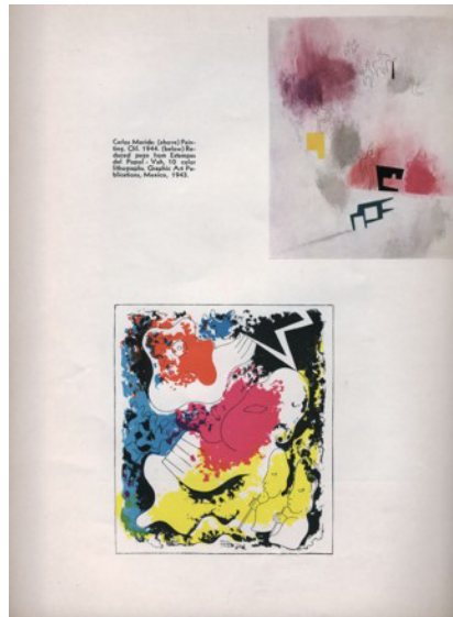
Fig. 7. Page from Dyn , no. 6, 1944, private collection