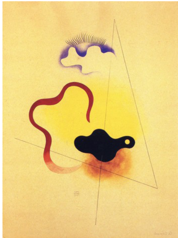
Fig. 3. Carlos Mérida, Transparencia de la memoria (Transparency of Memory), 1936, watercolor, gouache and graphite on paper, private collection

a means of developing a uniquely American art. Mérida felt he had begun to achieve this synthesis in his own work; in a set of notes for a lecture on Surrealism, he included himself among the examples of modern surrealist artists, noting next to his own name on the outline "derivations of an ancestral American type." 24 The lecture, which gave a general outline of the basic tenets of Surrealism, provided a series of "antecedents." Among these, Mérida included not only those often proposed by the Surrealists themselves, such as Goya, but Tarascan sculpture of West Mexico and the decoration at the Maya site of Chichén Itzá. Mérida embraced the Surrealists' own insistence that Surrealism was not a movement but a condition that transcended time and geography. Surrealism offered an escape from the folkloric and from social realism that dominated Mexican painting, and allowed him to negotiate the opposing poles of the Mexican School and international modernism, forging a space in between the two. It also gave him the opportunity to artistically engage his own