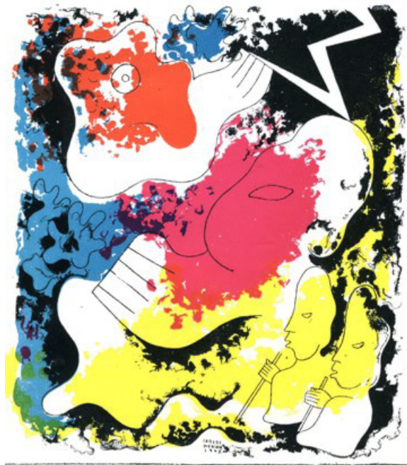
Fig.8. Carlos Mérida, page from Estampas del Popol-Vuh , 10 color lithographs, Graphic Art Publications, 1943, as reproduced in Dyn , no. 6, 1944