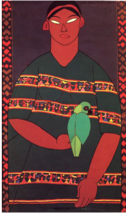
Fig. 2. Carlos Mérida, La india del loro (The Indian with the Parrot), 1917, oil on canvas, private collection, courtesy of Galería Arvil, Mexico City

any... [artistic] school. He simply interprets the autochthonous art of America. For two years he studie[d] the Maya civilization and now he dedicates his efforts to the culture of Teotihuacan." 17 Even Diego Rivera praised the "Americanism" of Mérida's work. 18 The enthusiastic reception of his exhibition suggests that Mexican artists and critics found in Mérida a model for the development of an art rooted in the Americas at a time when they sought a way to separate themselves artistically from Europe.