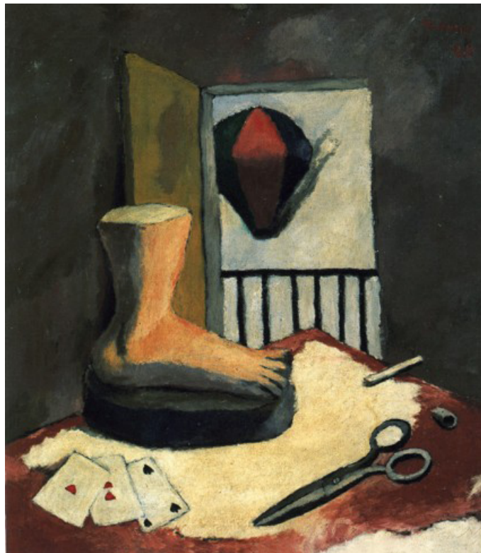
Fig. 5. Rufino Tamayo, Naturaleza muerta con pie (Still Life with Foot), 1928, oil on canvas, Colección Andrés Blaisten, www.museoblaisten.org