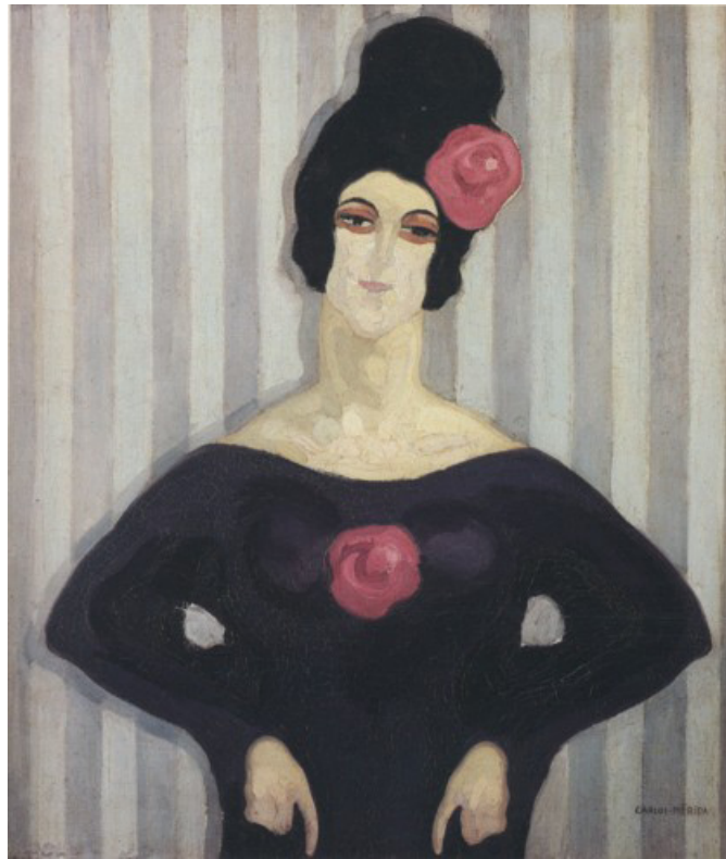
Fig. 1. Carlos Mérida, La mujer de la rosa (The Lady with the Rose), ca. 1912, oil on canvas, private collection, courtesy of Galería Arvil, Mexico City

and David Alfaro Siqueiros—who would receive individual galleries in the 1952 exhibition “L’art mexicain du précolombien à nos jours,” organized by the Mexican government and mounted at the Musée national d’art moderne in Paris, triggered a firestorm of criticism that Rivera and Siqueiros spearheaded. 8 These attacks were of course not accurate. Tamayo had in fact been a member of Mexico’s LEAR (League of Revolutionary Artists and Writers) in the 1930s. And, one might argue, his adoption of indigenous themes given his mestizo heritage was neither apolitical nor less socially engaged than the indigenism that drove artists of the Mexican School. 9 What’s interesting is that an artist perceived as apolitical, disengaged and not representative of the Mexican School by his Mexican colleagues found champions among the Surrealists, avowed Marxists who earlier promoted the didactic and politically strident murals of Diego Rivera as Mexico’s authentic art at the very